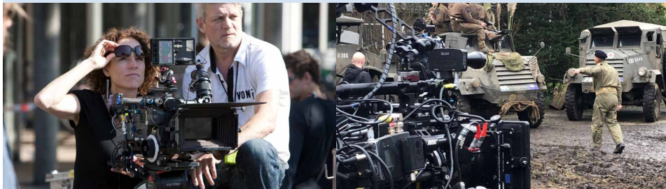
Loft.

An application for structural, 4-year financing directly from government (the so called BIS) has been submitted. The cultural advisory board will advise the government on June 4 th 2020.